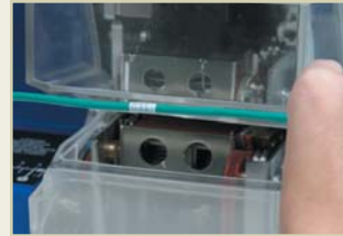
Print and wrap in two easy steps... with one machine in 5 seconds or less!