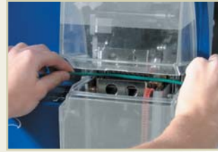
Select job, insert wire or cable.